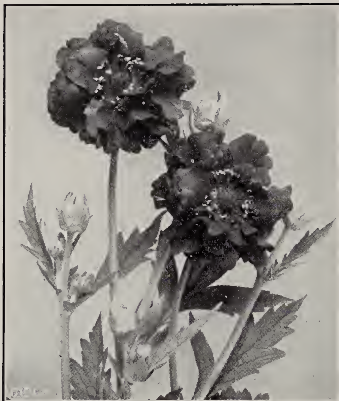
GEUM MRS. BRADSHAW